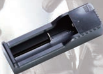
AC charger ACCCH-18650-21700