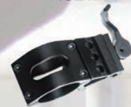
Tactical mount RGT9-TACM Mounts light to Picannity rails