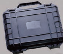
Storage box RGT9-STORAGEBOX