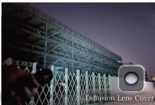
Diffusion Lens Cover